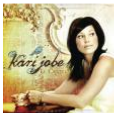
Kari Jobe/ Worship Leader