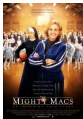
Mighty Macs/ Movie